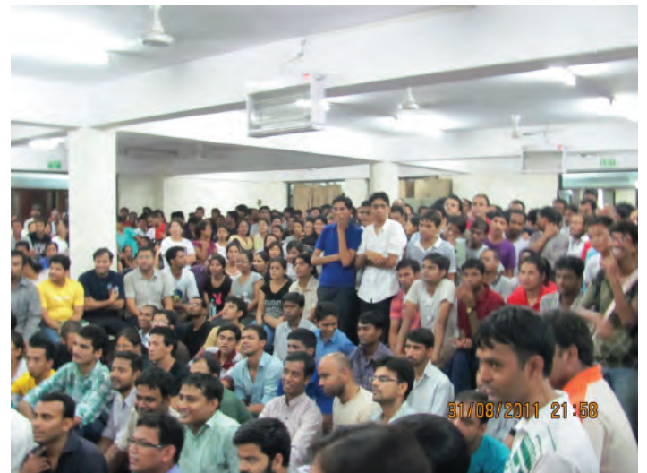
Housefull: More than 600 students came to listen to Dr Tharoor

The meeting was a great success and students found the the interaction with Dr Tharoor enlightening.