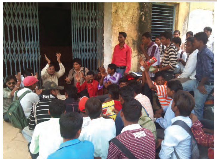
Students protesting outside college gate