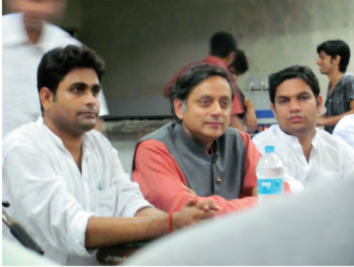
Dr Shashi Tharoor (Centre) with NSUI National President Hibi Eden

JNU NSUI organized a public meeting on the night of 31st August in JNU on the topic “ India after 20 years of liberalization ”. Dr Shashi Tharoor was invited to speak on the topic along with the NSUI National President Hibi Eden. More than 600 students attended the meeting to listen to Dr Tharoor. During the meeting, JNU NSUI Unit felicitated Hibi Eden for winning the Assembly elections in Kerala (Ernakulum) recently in which he won more than 30,000 votes.